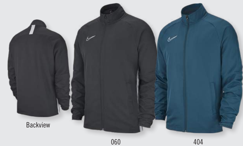
Backview 060 404