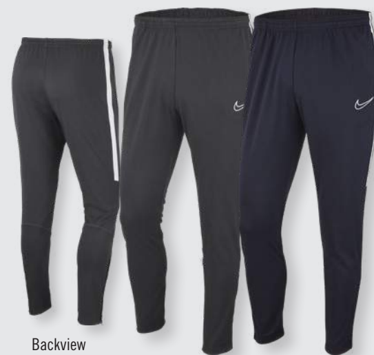
Backview 060 451

Youth: XS S M L RRP £ 22,95 Youth: XL RRP £ 26,95