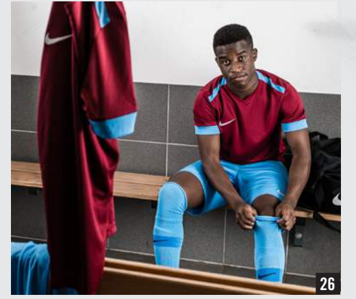
PARK DERBY II