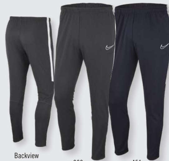
Backview 060 451

Youth: XS S M L RRP £ 14,95 Youth: XL RRP £ 16,95