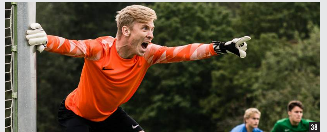
NEW PARK IV GK