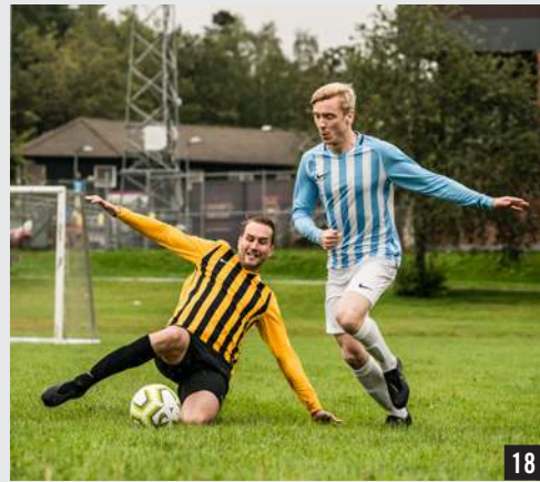
STRIPED DIVISION III