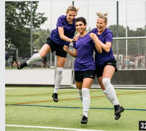
NEW WOMEN'S PARK VII