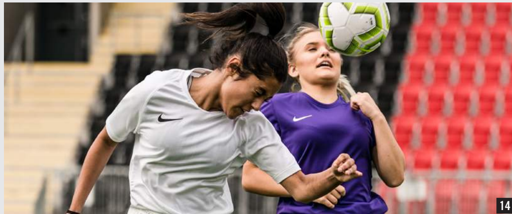
NEW WOMEN'S STRIKE