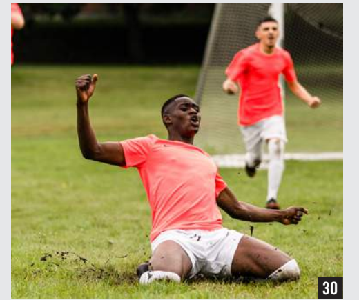
NEW PARK VII