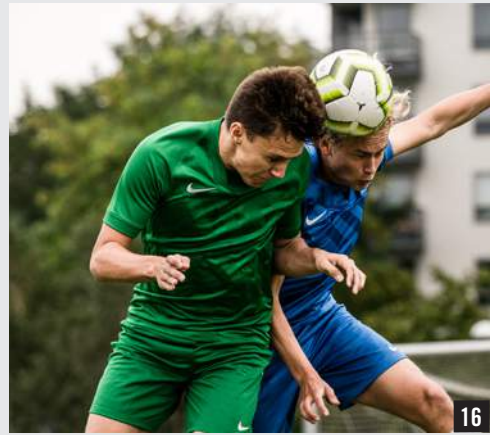
NEW CHALLENGE III