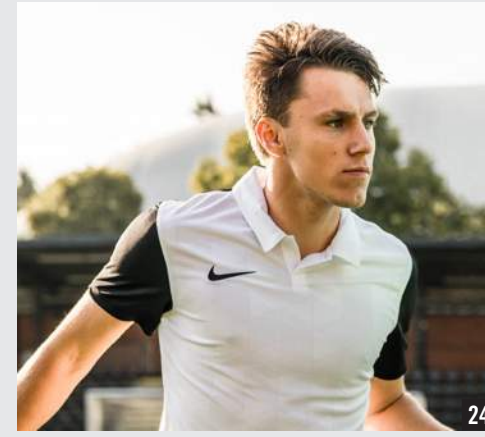
NEW TROPHY IV