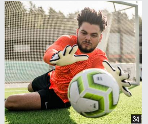
NEW GARDIEN III