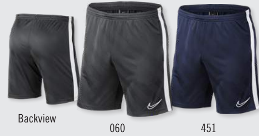
Backview 060 451